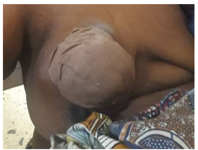
Figure 1A. The patient with right fungating breast mass - covered with dressing.