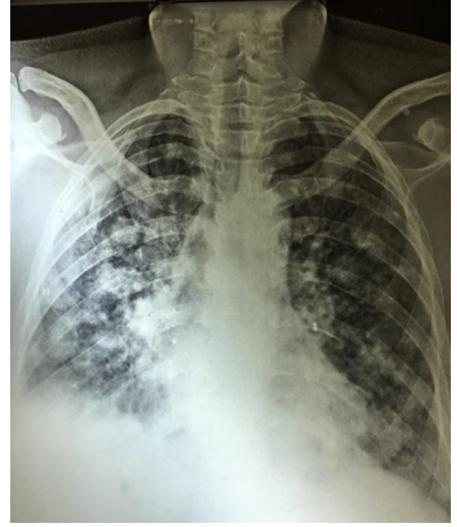
Figure 2. Chest X-ray (posterior-anterior view) showing multiple cannonballs metastases

Incisional biopsy of the maxillary swelling was undertaken to confirm the histological diagnosis. The core biopsy of the right breast showed infiltrating ductal carcinoma Not Otherwise Specified (NOS) Nottingham grade III and maxillary mass showed similar cells with pleomorphism. The histopathology report of the maxillary mass was metastatic carcinoma secondary to intraductal carcinoma